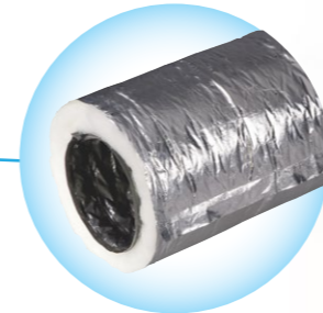
BCA Standard Flexible Duct